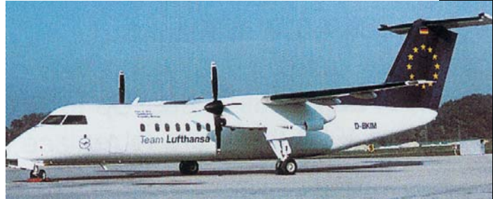
Are you still in the turbo prop age?

VirtualSoft transforms your information rich company into a knowledge-based corporation. When that happens, indexed information in rich-media formats flows through various offline and