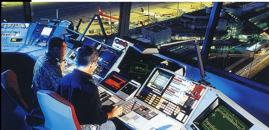
Without knowledge updates, can pilots fly?

At a nominal cost, you could build bridges with print, electronic, radio and internet journalists.